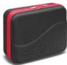
Sea Dragon Case (SL942) (Case NOT included with 1500F light)