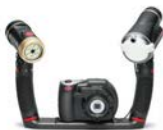
DC1400 Pro Duo w/ light, flash and dual tray