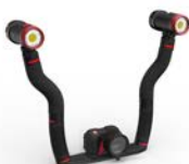
Micro 2.0 Pro 5000 w/ 2 lights, 2 flex arms, and dual tray