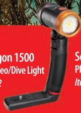
Sea Dragon 1500 Photo/Video/Dive Light Item SL672