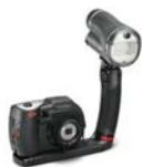
DC1400 Pro Set w/ single flash

Get brighter, more colorful results by expanding your Sea Dragon underwater camera system. The modular Flex-Connect arms, grips and trays easily clicks together to create these popular configurations: