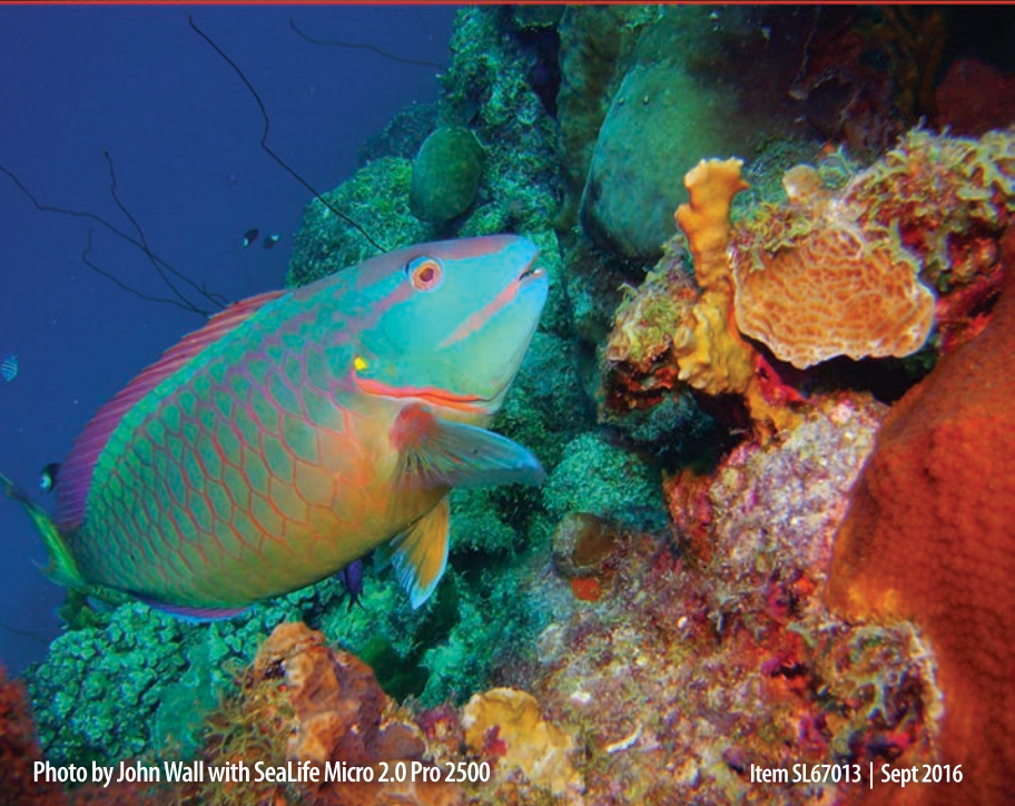
with SeaLife Micro 2.0 Pro 2500