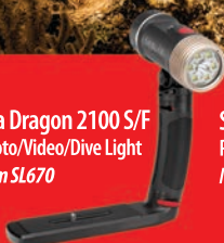
Sea Dragon 2100 S/F Photo/Video/Dive Light Item SL670