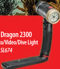
Sea Dragon 2300 Photo/Video/Dive Light Item SL674