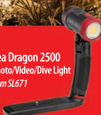
Sea Dragon 2500 Photo/Video/Dive Light Item SL671